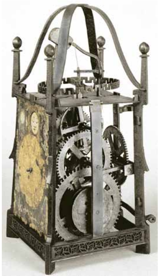
Fig. 6. French or Flemish Gothic clock with a painted iron dial, transverse trains and an original balance and verge escapement, possibly pre-1500. Hand and bell missing. Very unusual pierced tracery applied to the lower sub-frame. Ring and spacers for wall hanging and hinges for side doors, now missing. Nag's head striking. (Mainfränkisches Museum Würzburg).

Germanic clocks (Fig. 1) have top and bottom sub-frames in the form of square rings linked by corner pillars, while Flemish clocks have a top plate (Fig. 6) and sometimes a lower one as well, though a lower sub-frame is more usual. Often these 'plates' are in the form of an open flat frame (Figs 5 and 9). The dials of Germanic clocks extend above and below the sub-frames but on Flemish clocks they stop below the top plate. Whereas Germanic clocks have the familiar arrangement of the wheels being parallel to the dial, Flemish clocks sometimes have all the train wheels at right angles to the dial (Figs 6 and 8), with the drive to the hand and countwheel by small starwheels. 17 Flemish clocks occasionally have a foliot instead of a circular