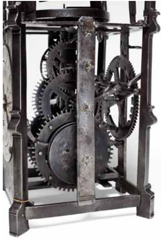
Fig. 8. Right-hand side showing the wheels at 90 degrees to the dial and the countwheel, the latter with internal notches. There is warned striking. (Kellenberger Clock Collection, photo: Michi Lio).

found on some early English and Dutch turret clocks, e.g. the Dover Castle clock of about 1633–40. 18 Germanic clocks have a dome-shaped bell or bells or a variant, but on some