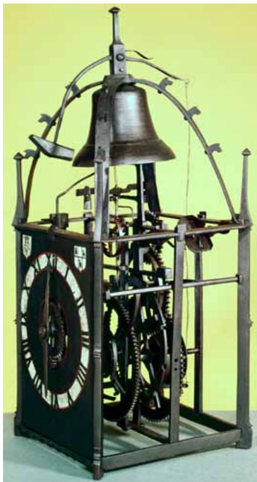
Fig. 5. Sixteenth-century French or Flemish Gothic clock with a Gothic bell, a central gathered countwheel and warned striking. The complete escapement and probably the foliot are replacements. (Science Museum/ Science & Society Picture Library, Inv. 1954-184).

To understand the lantern clock it is necessary to consider what went before. We need to compare the design and technical features of the earliest English lantern clocks, which first appeared about 1600 (see Part 2), with Gothic clocks of a similar period. However, there are several things that need to be borne in mind. Some authors have classified almost all early iron clocks as 'Gothic' whereas the term should be restricted to those similar to Figs 1, 2, 5–7, having buttressed corner pillars set at 45 degrees to the frame, together with ornaments on the bell frame, all based on the designs of Gothic architecture. It is often not appreciated that there are two distinct 'schools' of Gothic clocks: Germanic (Figs 1–4) — including the German-speaking regions of northern Switzerland and the Austrian Tyrol that border southern Germany — and Flemish/