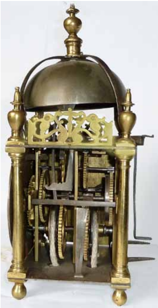
Fig. 11. Typical lantern clock construction with cast brass pillars, feet and finials. The iron plates are unusual. The cruciform front and rear movement bars are characteristically English, as are the vertical hammer spring and L-shaped stop. Originally with a balance, later converted to anchor escapement and long pendulum. (Private collection).

All the wheels of Gothic clocks are of forged iron with separate spokes (crossings) and rim (also known as the band), fitted to arbors that pivot directly in the iron movement bars (any brass bushes are later restorations), whereas the wheels of lantern clocks are filed from one-piece brass castings. The train wheels and pinions of Gothic clocks are positioned away from the ends of their arbors, while they are almost at the ends of the arbors on lantern clocks.