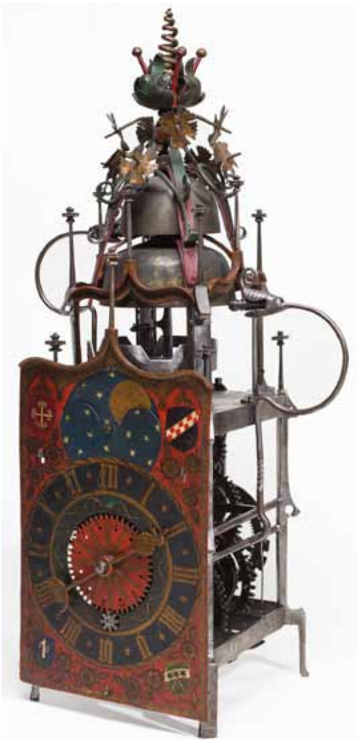
Fig. 2. Quarter-striking Gothic clock by Erhard Liechti, Winterthur, dated 1572, with moon phase and alarm (alarm mechanism missing). Painting restored and balance possibly replaced.