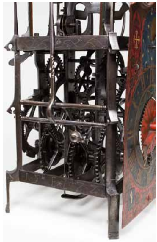
Fig. 4. Left-hand side of the movement with prick-punched decoration on the upper part of the frame and signed '15 E*L 72' on the lower. Note the hammer spring below the frame, internal teeth on the countwheel, lever for lifting the balance and the external fly (restored).

(Kellenberger Clock Collection, photos: Michi Lio).