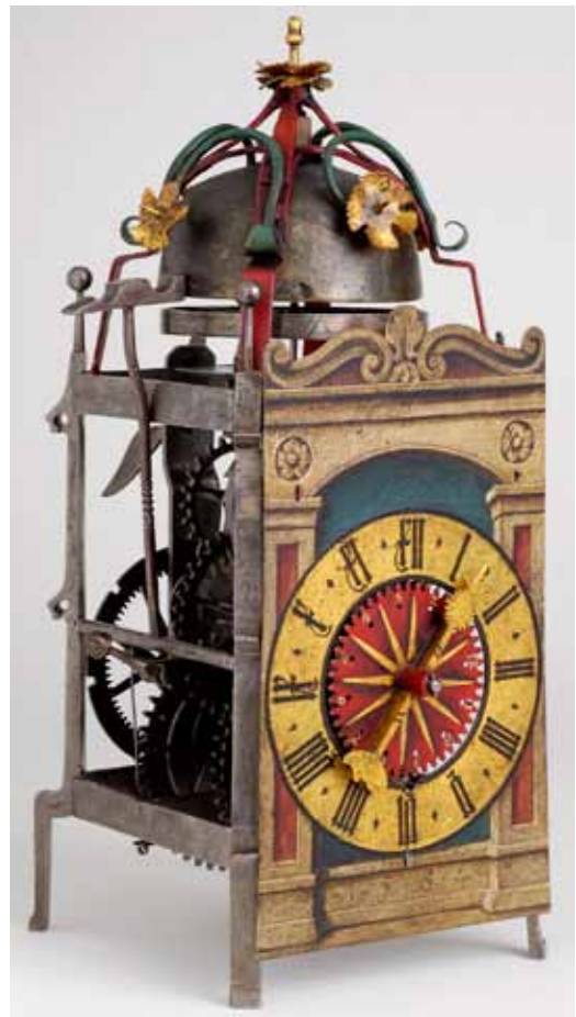
Fig. 1. Hour-striking clock with alarm by Erhard Liechti, Winterthur, Switzerland, 1584. Dial new, the flowers on the bell frame and possibly the balance are restorations. (Deutsches Uhrenmuseum, Furtwangen, Inv. 3-0581).

At the start of the seventeenth century therefore, the essential elements of clock mechanisms had become well tried and tested over the previous two hundred years