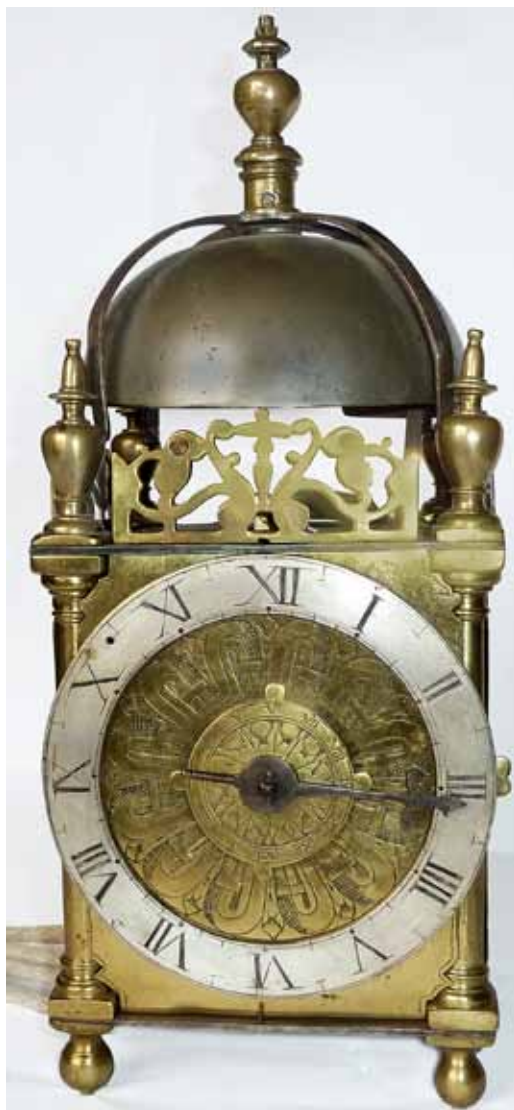
Fig. 10. A very early unsigned lantern clock with an alarm, possibly about 1610. The egg-and-dart design in the centre of the dial was also used by Robert Harvey before 1614. The front fret is a replacement copied from an original side fret. (Private collection).

Gothic clocks have one-piece rectangular painted iron dials supported, on Germanic clocks, on arms riveted to the front movement bar and held by taper pins. There are no frets, side doors or back plate, and no hoop or spikes for hanging on a wall. They sat on a wall bracket and are often called Konsoluhren (bracket clocks), but have, of course, no similarities to the present-day concept of a spring-driven bracket clock. Sometimes Flemish Gothic clocks have a ring at the rear and spacing arms rather than spikes, but these may have been to prevent it toppling off a wall bracket rather than being its main means of support. Lantern clocks have a separate silvered brass chapter ring which overlaps the sides of the rectangular engraved brass dial sheet. An engraved cast-brass fret sits above the dial with plain ones of the same design at the sides. An iron rear cover plate and brass side doors are fitted as well as a hanging hoop and spikes. They are often signed, although several very early clocks are anonymous (Fig. 10). The brass bell strap is held on the corner