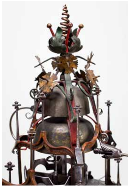
Fig. 3. Highly decorative bell frame and hammers of the Liechti clock. Largely original with just two pinnacles replaced.