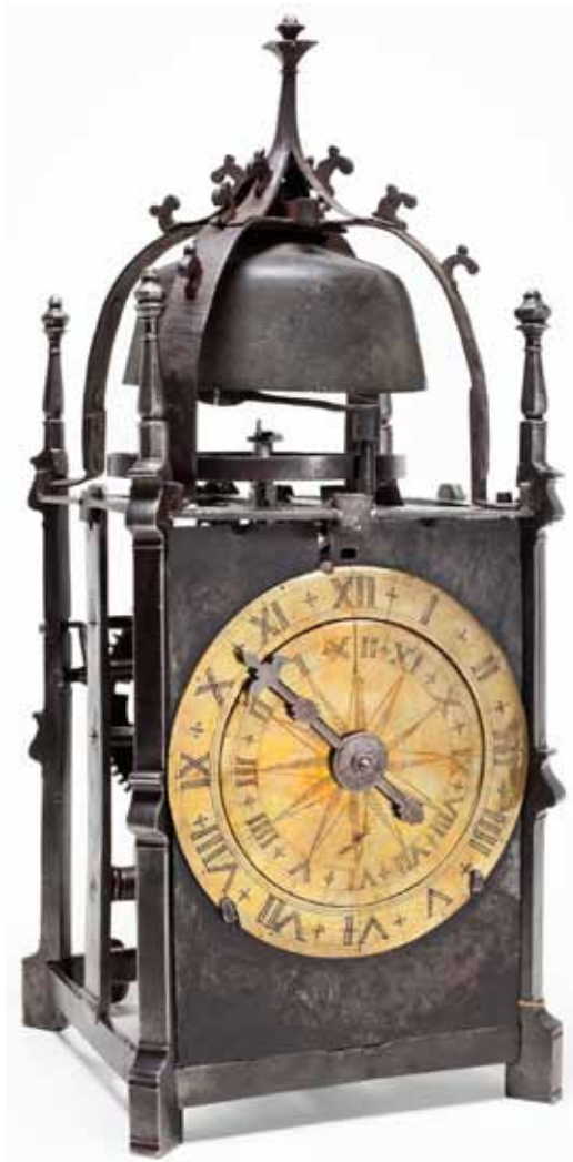
Fig. 7. An early French or Flemish Gothic clock, fifteenth or sixteenth century, with a brass chapter ring and alarm disc and standing on short feet. The bell frame and hand are later. (Kellenberger Clock Collection, photo: Michi Lio).

found on some early English and Dutch turret clocks, e.g. the Dover Castle clock of about 1633–40. 18 Germanic clocks have a dome-shaped bell or bells or a variant, but on some