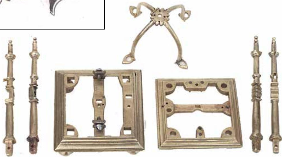
Figure 7 (below). Components of the frame.