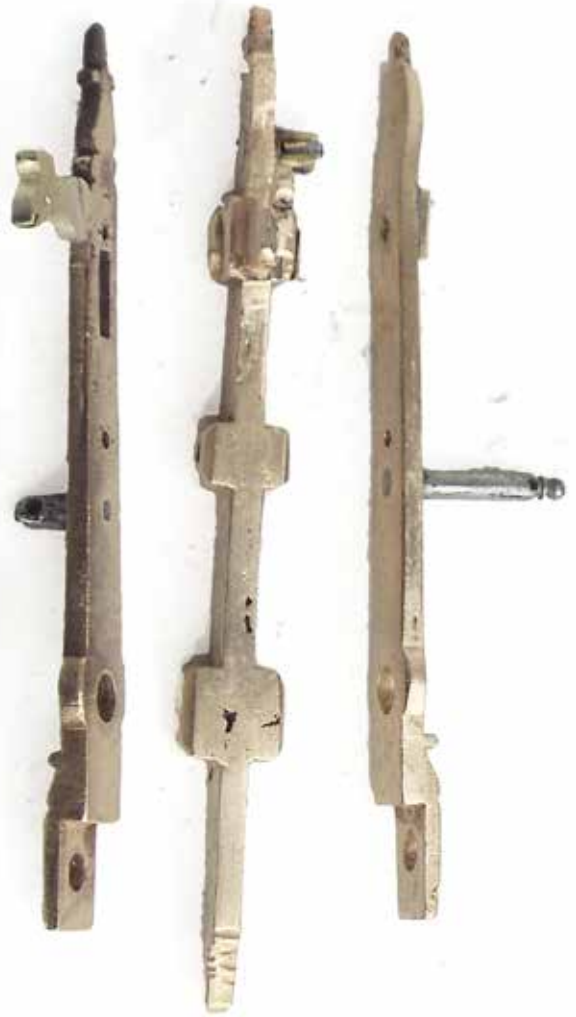
Figure 16. Side view showing the thicker sections on the central bar.