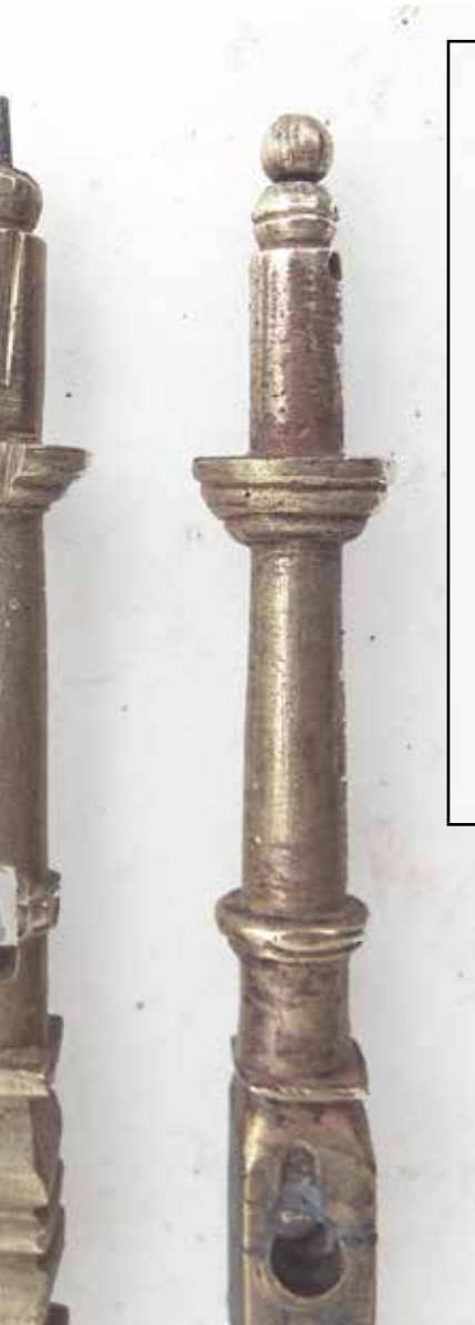
Figure 9. The top of each pillar has a tiny ball fitted to a spigot.