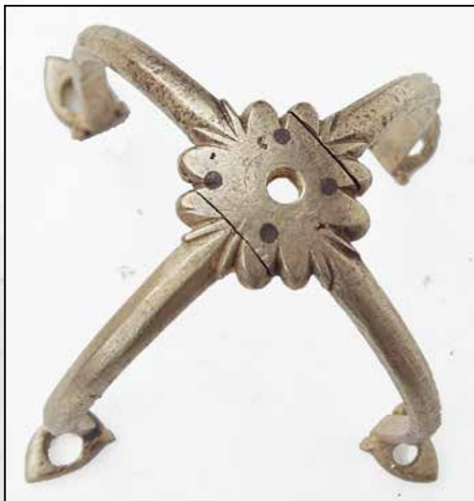
Figure 10 (left). The bell strap.