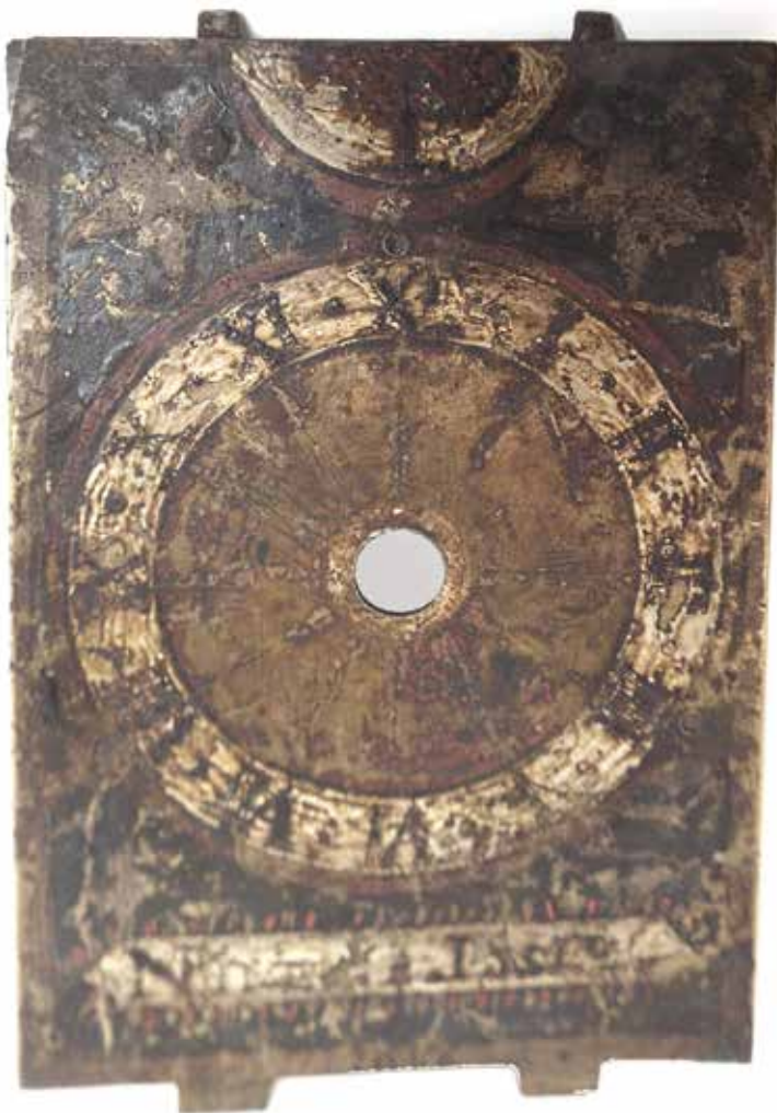
Figure 4. Digitally enhanced image of the dial.

done at a time when an engraved dial might have been expected. It is only 2\frac{3}{4} in (68mm) wide and 3\frac{3}{4} in (98mm) tall, making it one of the smallest recorded painted clock dials.