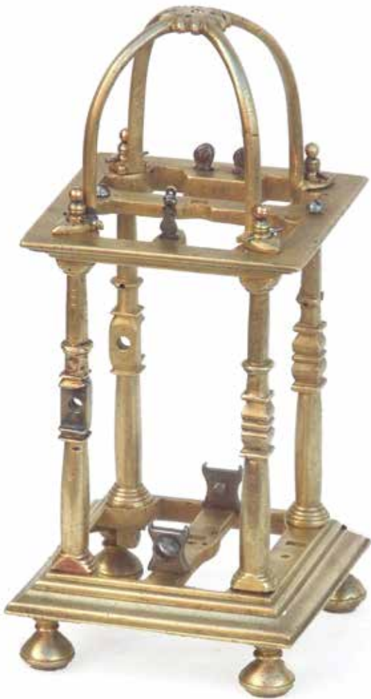
Figure 13, The assembled clock frame.