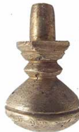
Figure 12. Bun foot with a tapered spigot.

from front to back, and on the upper one from side to side. While figure 7 shows the top of these castings, figure 8 shows the undersides, with the feet in place.