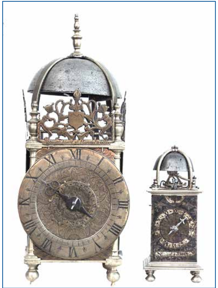
Figure 2. The Flemish miniature dwarfed by a London clock of about 1650.

Lantern clocks were made in all sorts of sizes, ranging from miniatures to giants, though most English ones are of a 'standard' size of about 15in (381mm) tall including a finial at the top. The one discussed here is a very small example only 8 1 / 4 in (210mm) tall and 3in (89mm) wide, made in French Flanders in a late Renaissance style, figure 1 . Its very small size can be appreciated when sitting alongside a regular London