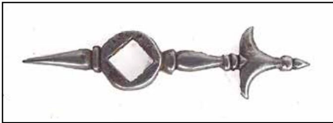
Figure 5. The tiny hand, only 1 1/2in long overall.