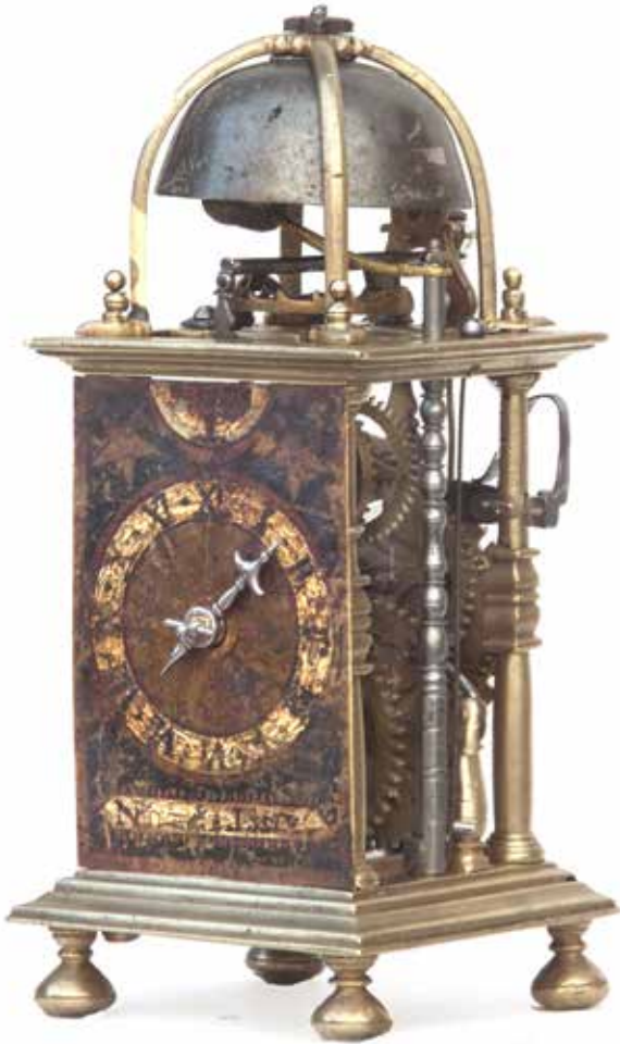
Figure 1. Miniature Flemish lantern clock.