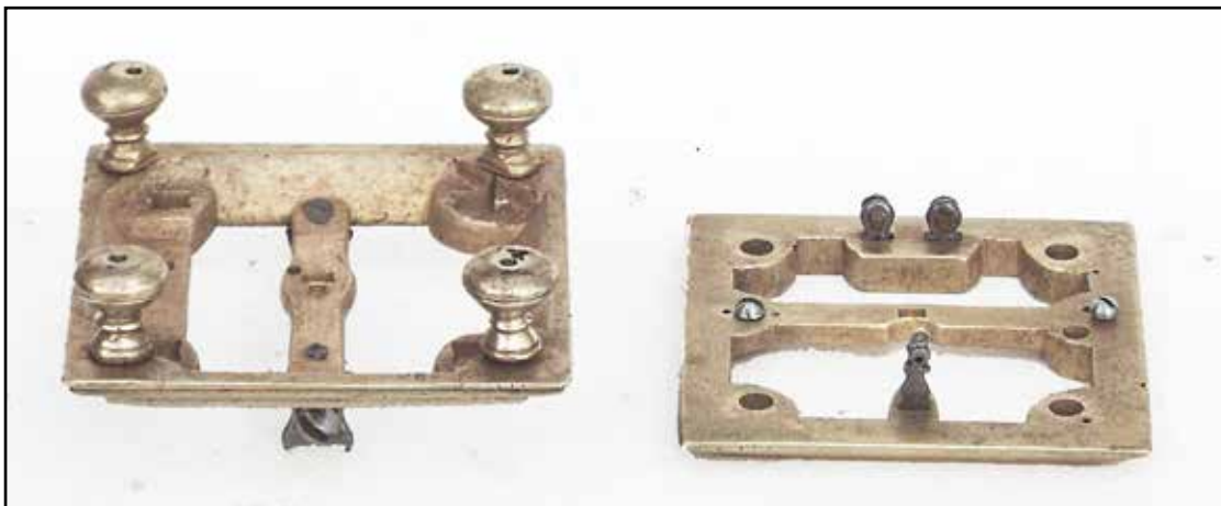
Figure 8. Undersides of the frame castings: lower (left) and upper (right).

clocks), or more usually tabs fitting into slots in the top and bottom plates. This entails lifting the top plate slightly, which is very inconvenient compared to the easy method on this clock