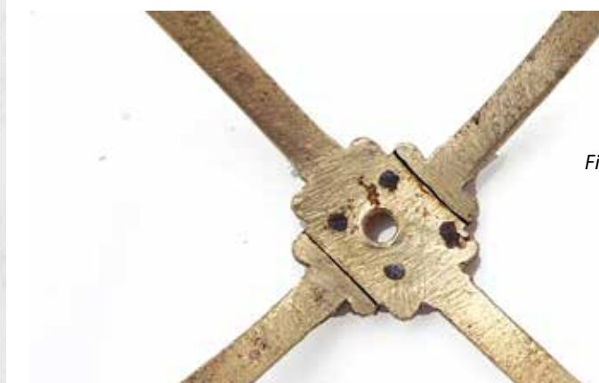
Figure 11. Half-lap joint on the bell strap.