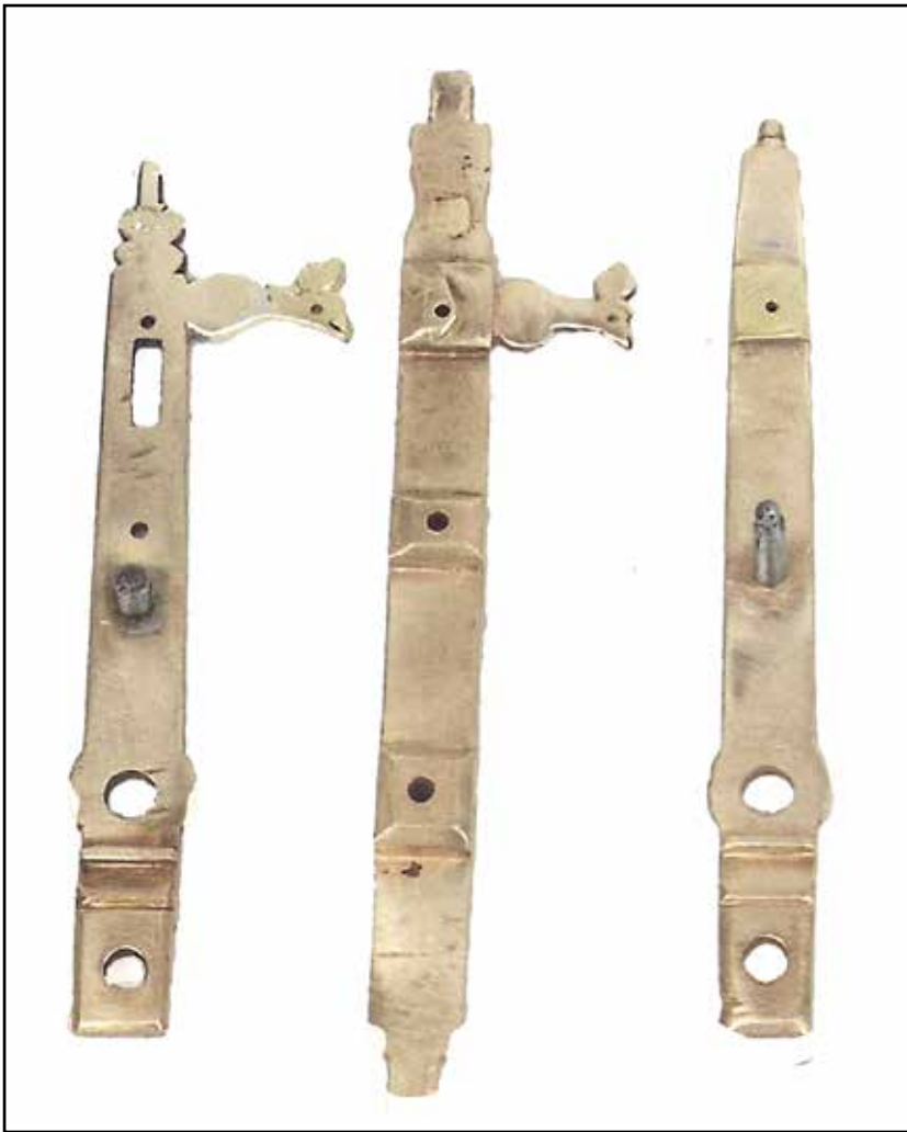
Figure 15. The movement bars showing the side arms.