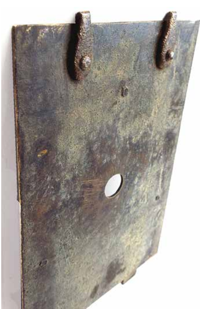
Figure 3. Swivelling latches on the rear of the dial.