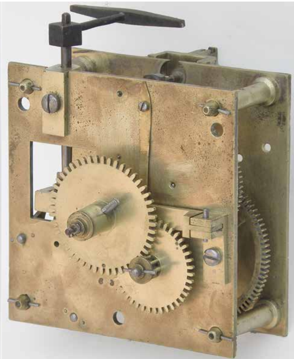
Figure 38. The hour wheel in position showing the let-off pin for the alarm.

detail that at first looks wrong, but in fact has a very practical purpose. Figures 29 and 37 show that the alarm hand appears to be too long and protrudes over the edge of the dial.