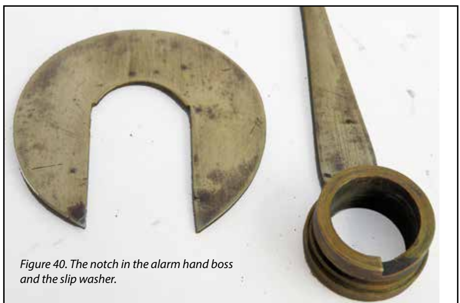
Figure 40. The notch in the alarm hand boss and the slip washer.

Having a clear picture of the components its operation becomes readily understandable. With the dial firmly in place the boss on the alarm hand presses against the pin so that the hour wheel pushes, via the minute wheel (hence its extended rear pivot), the alarm lever towards the rear to lock the alarm crownwheel. As the hour