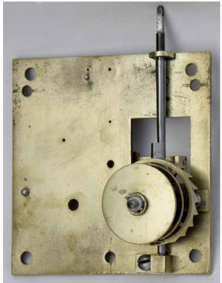
Figure 33 (above left). Rear of the front plate with the alarm verge.