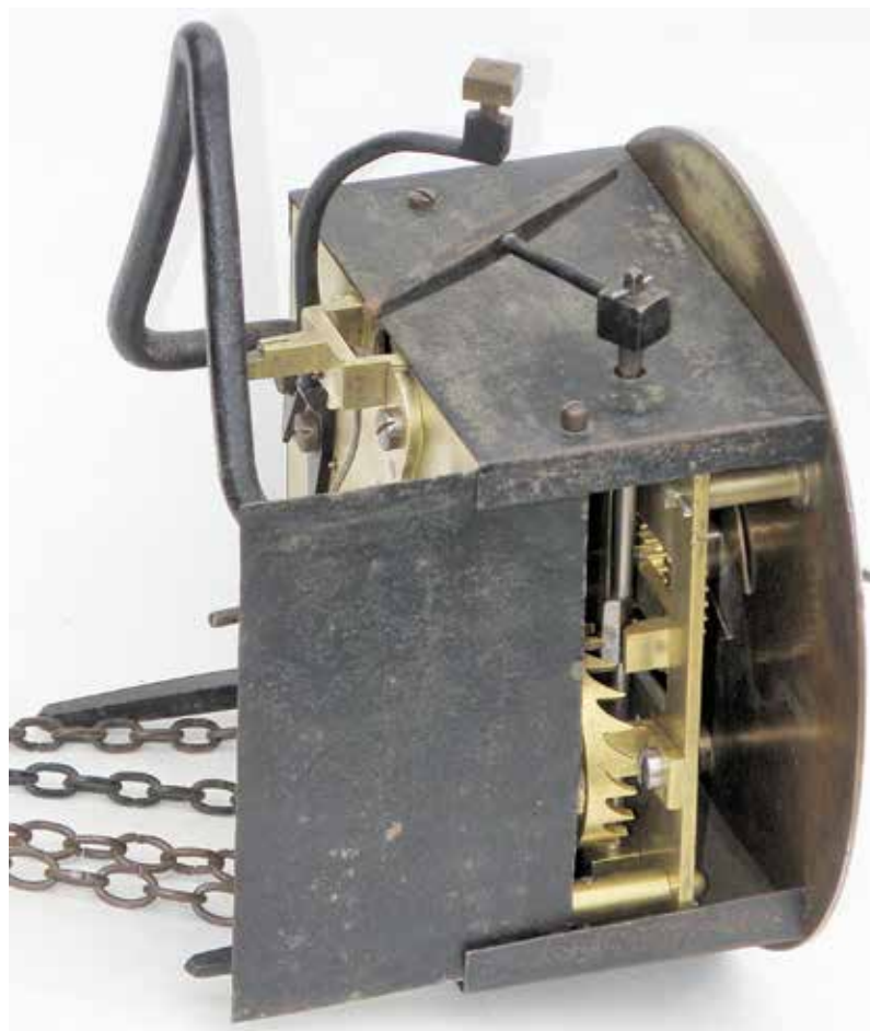
Figure 31 (above right). The sides of the cover slide into place.

the spikes screw into the riveted ends of the bottom two pillars. The rear plate is numbered '6334', as is the front plate and the rear of the dial, the last digit being stamped over either a '9' or '0'—no doubt someone had been given a number that had already been allocated to another clock. Based on the relatively few clocks that were both numbered and dated, this one was made about 1846-7.