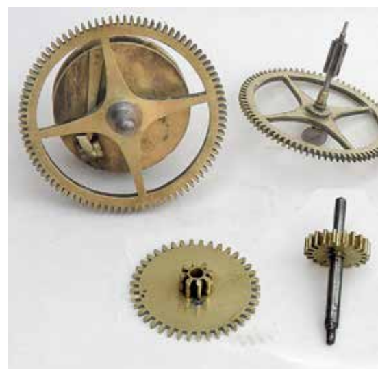
Figure 32. The going train (left), alarm crownwheel (right) and motionwork (bottom).

We now come to the alarm, which is the main feature of interest for this series. The alarm itself is the usual crownwheel and a vertical verge with the hammer at the top. The winding click of the weight pulley, like that on the going greatwheel, is of the pivoted type which is kinder to the crossings than the strong circular combined spring and click used on eighteenth-century English pull-wind clocks. This type of click is shown in Samuel Harlow's booklet THE CLOCK-MAKER'S GUIDE , published in 1814 and it is likely that it was introduced by either Harlow or Whitehurst. The alarm sits behind the left-hand side of the front plate, with the verge supported on brass cocks, figure 33 (in this view the lower pallet, just above the bottom cock, is pointing away from the reader and hence not visible). The alarm