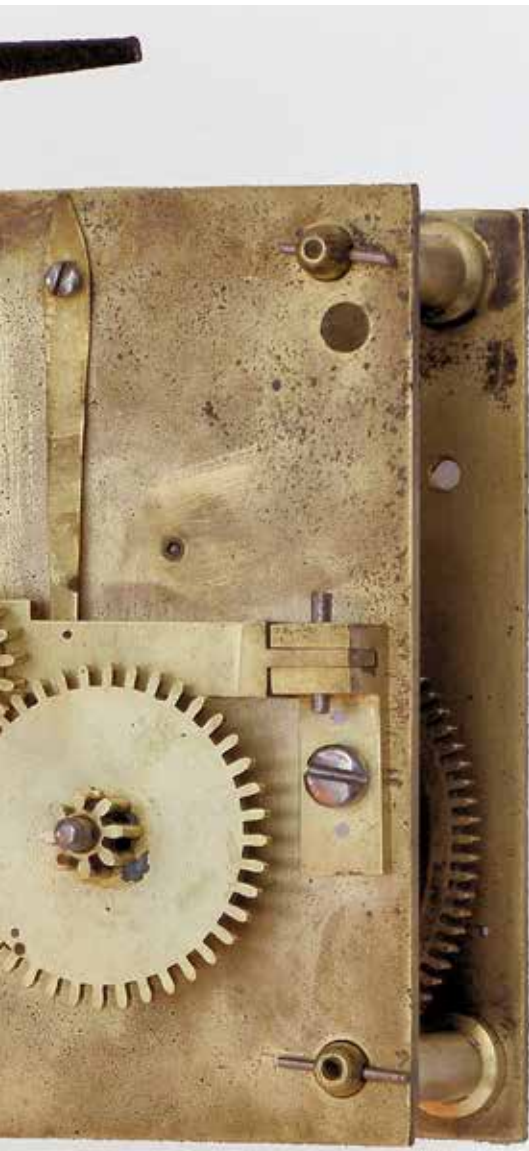
Figure 37 (below). Dial rear with the boss of the alarm hand held by the slip washer.