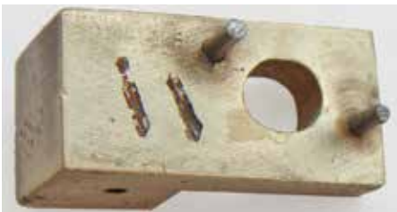
Figure 39. The casting mark on the lower verge support.

wheel respectively, with a friction spring at the rear for hand setting, are the same as any other two-handed 30-hour clock, figure 36 . The hour-wheel pipe sits over the minute-wheel arbor and is supported at the front by the dial, again typical of brass-dial 30-hour clocks. This pipe carries a stout pin, figure 38 .