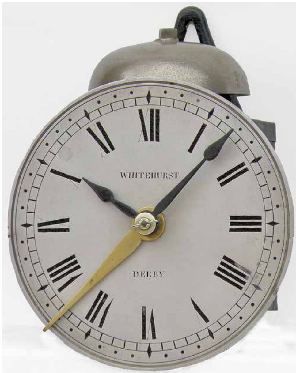
Figure 29. Round-dial wall alarm signed 'Whitehurst Derby'.

Figure 29 shows the 6in (15cm) diameter silvered brass