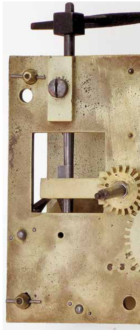
Figure 36. The pinion-of-report, the intermediate wheel and minute wheel in place.